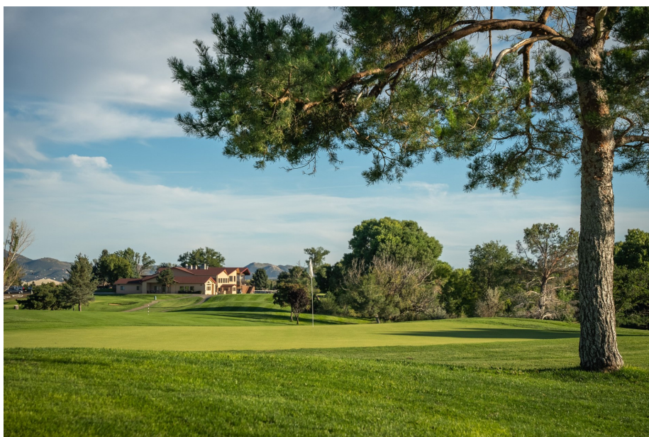
Hole #1 at Prescott GC—Summer

In addition, we have outlined key bunkers on the course and a plan is being developed for further improvements.