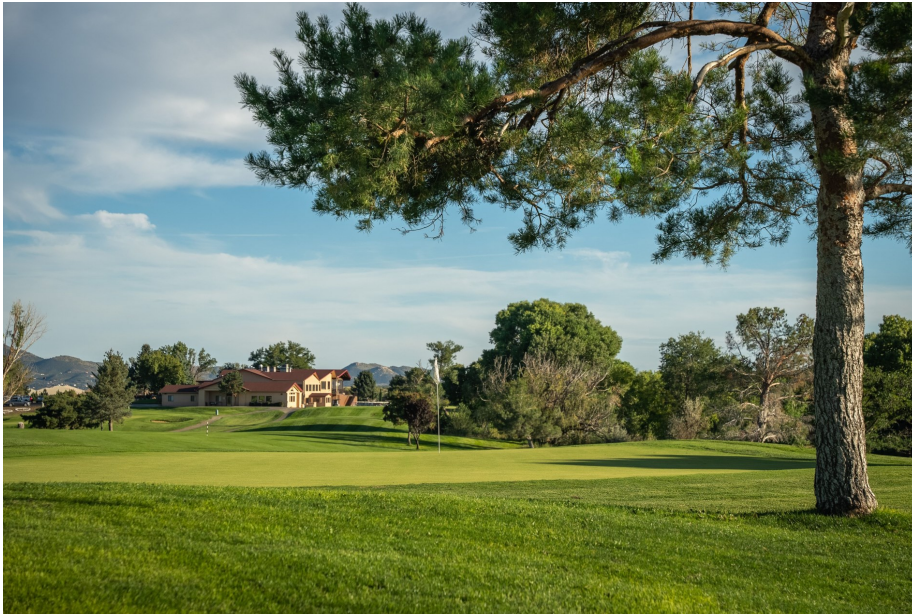
Hole #1 at Prescott GC—Summer 2022